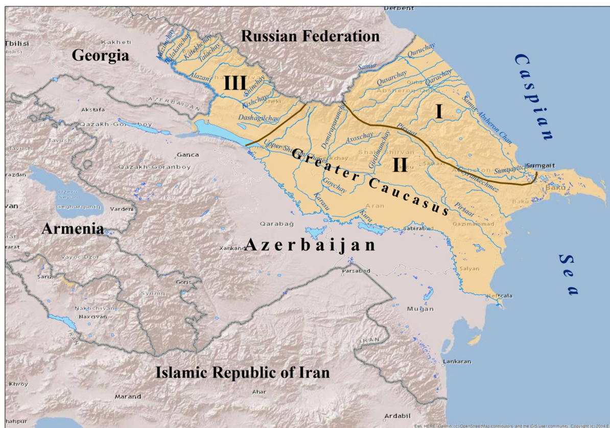
Fig. 1. Hydrological map of the study area

The Greater Caucasus is rich in fossils and mineral water sources, including oil, natural gas, polymetallic and copper ores, as well as limestone, marble, clay and other construction materials.